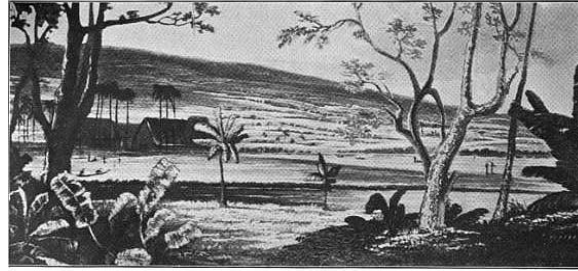
HILO SETTLEMENT AT THE TIME OF LORD BYRON'S VISIT IN 1823.